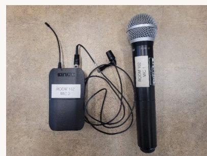
Wireless and Lapel Microphones